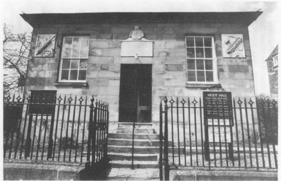
2. The Moot Hall, Wirksworth.