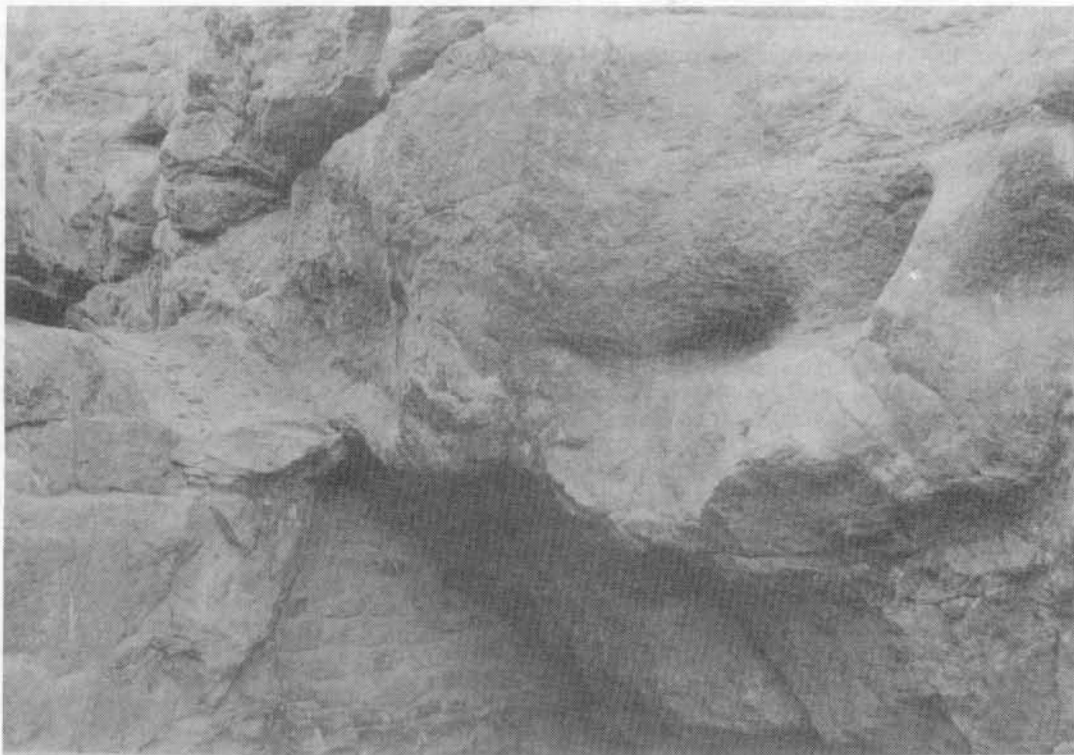
3. Engine Vein viewed from the east. Note the distinctive peck marks and the smooth and rounded appearance of the large pit on the right-hand side.