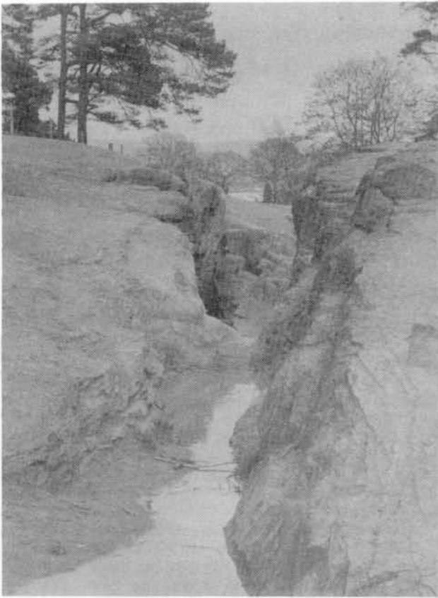
1. Engine Vein openworks viewed from the west.