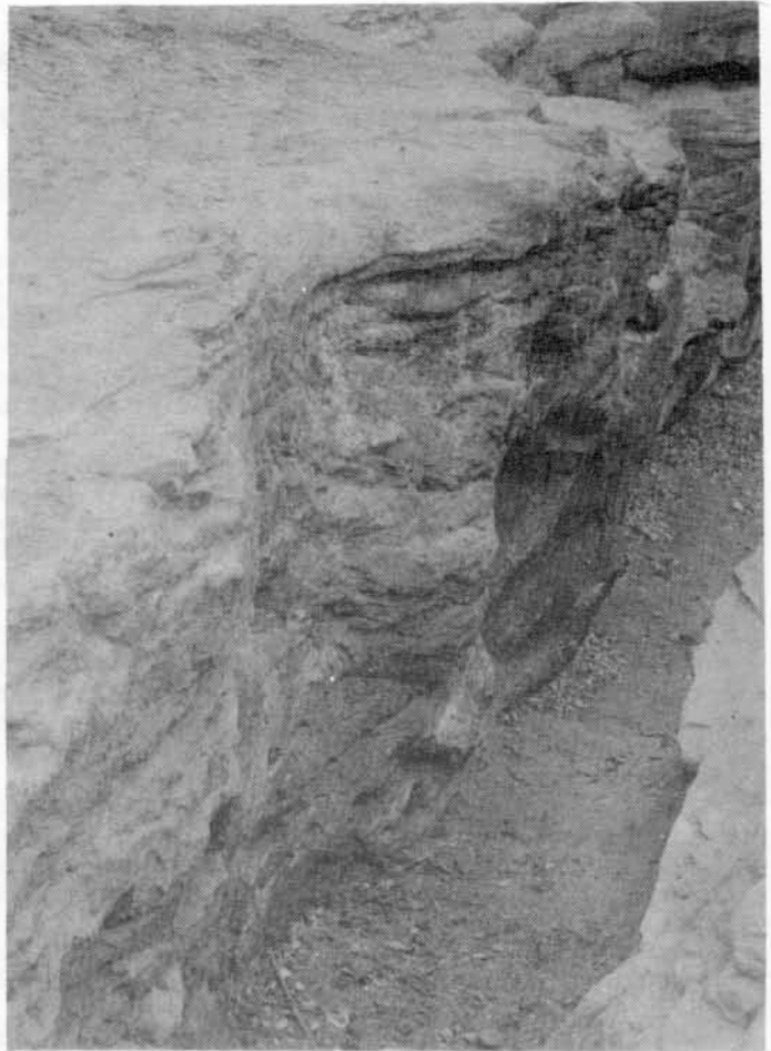
2. The intersected ancient pits at Engine Vein.