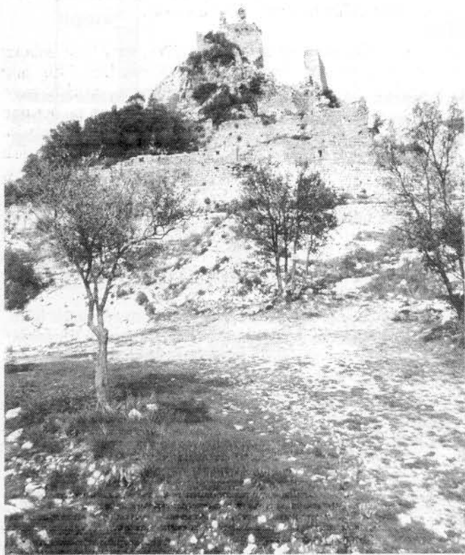
Plate 1. Ruins of Rocca San Silvestro, Campiglia Marittima.