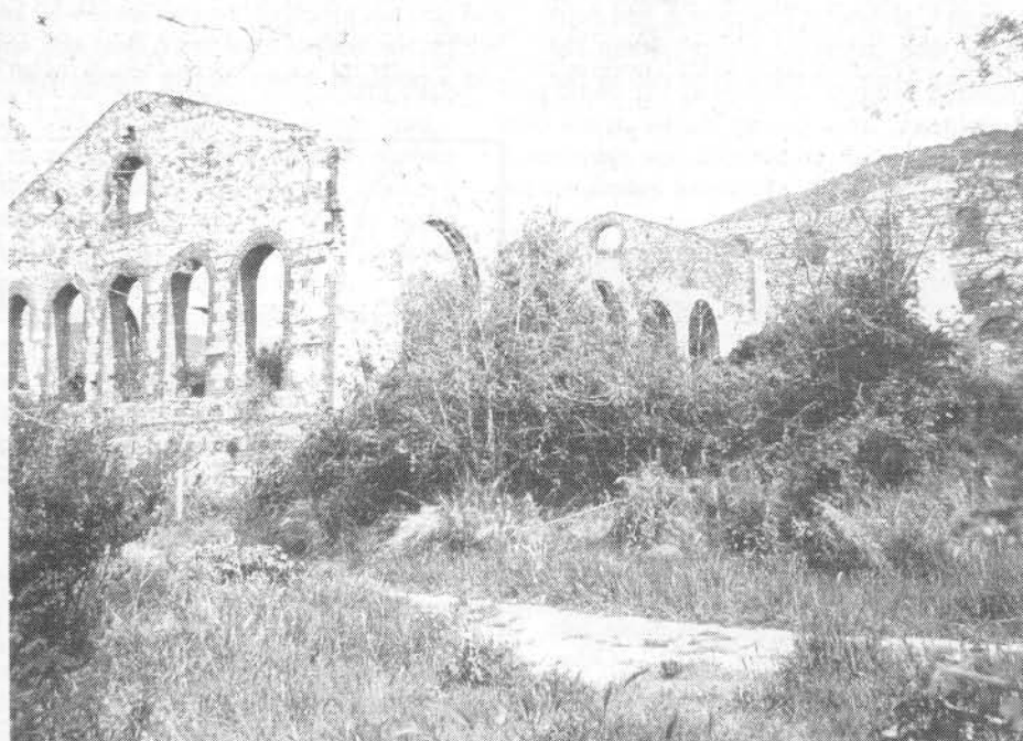
Plate 3. Ruins of the 1904 Etruscan Mining Company copper smelter.