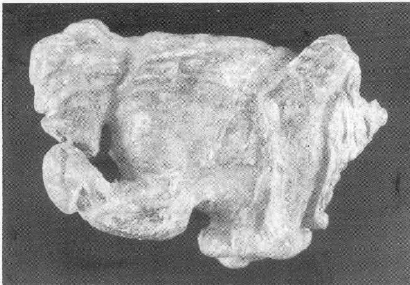
(b) Horse's rump, tail, part of back leg, and rider's leg facing backwards.