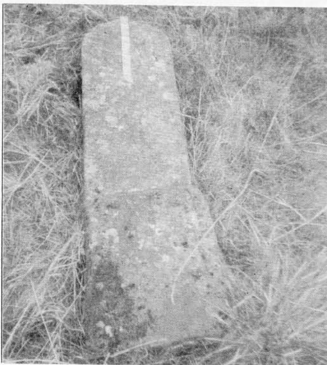
(Above) The still-standing Hayward Stone south of Picking Pitts Gate.