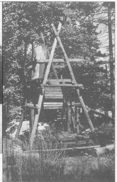
Wooden winding gear on shaft on Long Rake.